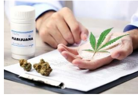
Product Lifecycle Management