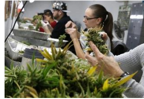
Human Resources Management